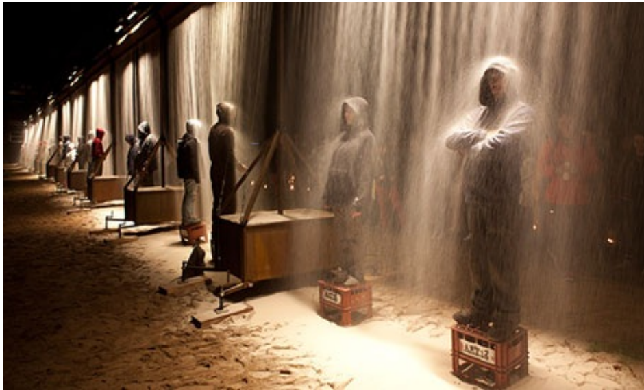
Celebrating performance design ... The Sand, by Jesus Hernandez, at World Stage Design in Cardiff in September.